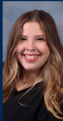
Payton Cook Pearl Upper Elementary