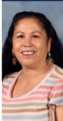
Corina Beach Pearl Lower Elementary