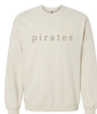
Sand with Taupe Embroidery