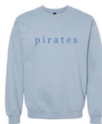
Stone Blue with Dark Blue Embroidery