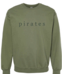
Military Green with Dark Green Embroidery