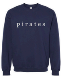
Navy with White Embroidery