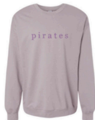
Paragon with Mauve Embroidery